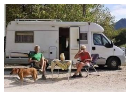
The kids won't move back home if they can't find it!

We will not be supplying folders for the newsletters. It seems that very few people printed their newsletters for the previous national rally and it appears that more people are now finding it easier to locate data on their computers and phones. We hope that you find our website easy to navigate. As we distribute more information to members, that information will also be added to our website.